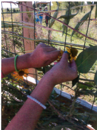
Alyssa Gurnsey weaving in a wildflower.