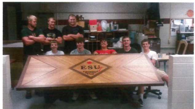
The construction class showing off their craftsmanship.

The ESU already had the table legs so we just designed the top for it. The idea behind