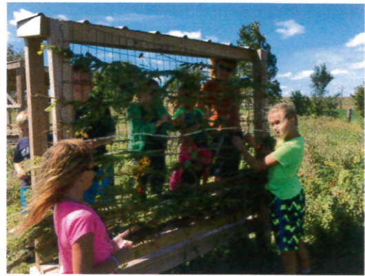
The 4 th graders adding in the finishing touches.